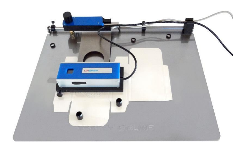
Figure 3: CREASY EGUIDE-PRO

The Figure 1 shows the geometry of the Embossing Test Patch. It fits into an area of 15mm by 8mm and contains two elements that will be embossed with different depths. The depth of one element should be slightly less than the minimum depth of any other embossing feature on the card board. The depth of the second element should be slightly deeper than the depth of any other embossing feature on the card board.